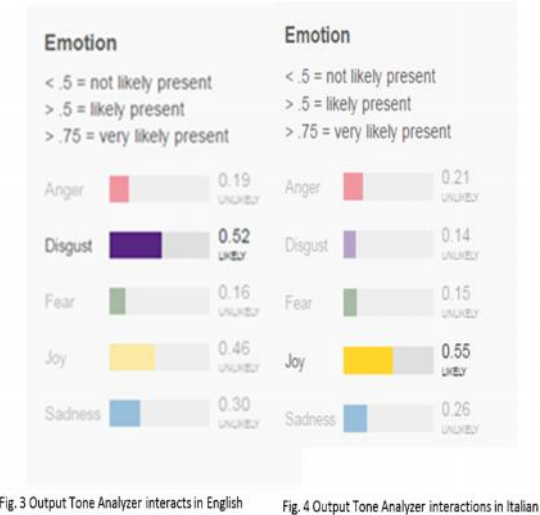
Fig. 3 Output Tone Analyzer interacts in English

Fig.3 Emotion of interactions with questions in English and Italian